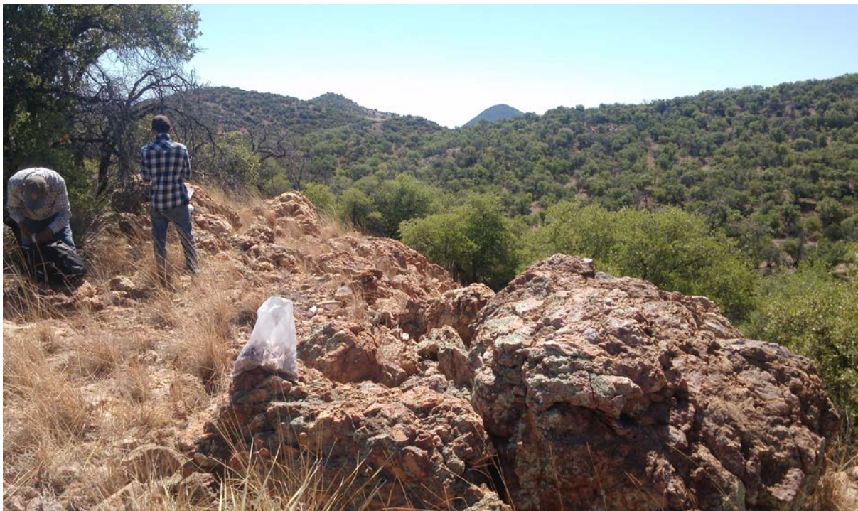
Figure 1: Photo shows outcropping ultra-high-grade (+1,000g/t Ag) silver mineralisation