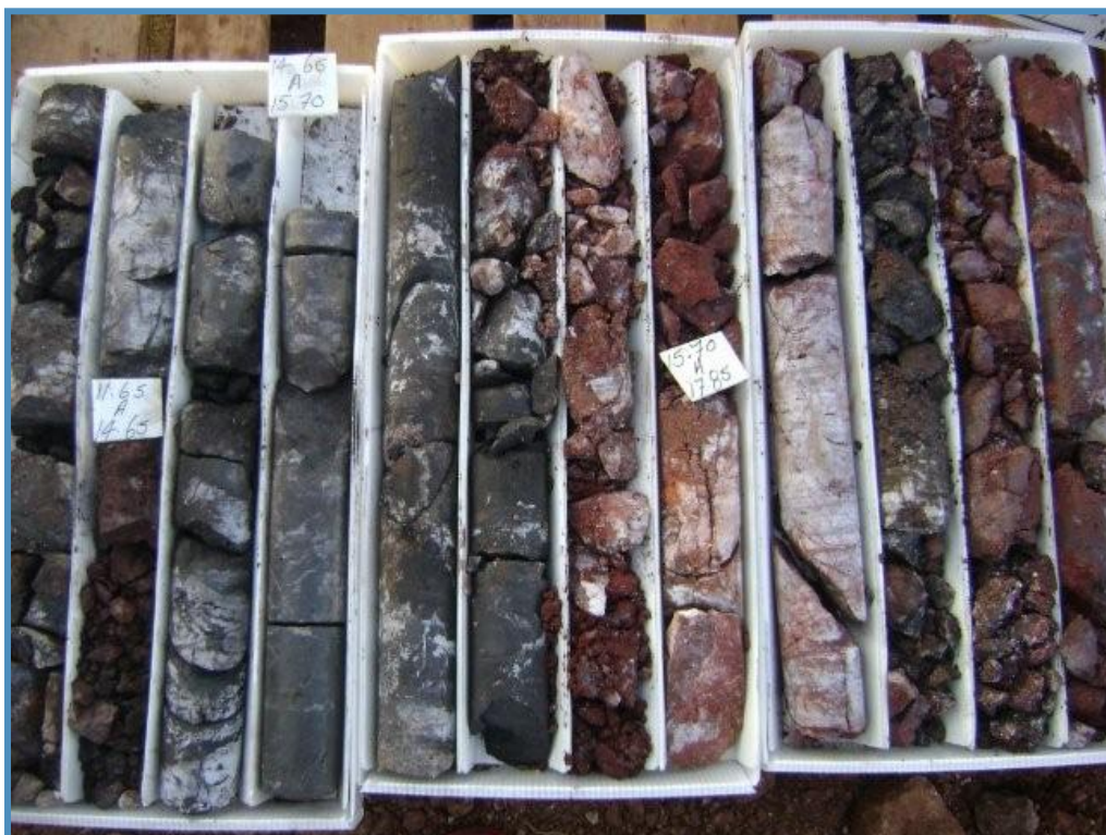
Figure 1: Core from Los Chinos diamond drill hole LCH-DD-002, showing brecciation and intense manganese and iron oxide development.

Azure's initial surface exploration at Los Chinos identified a 2km x 1km area containing zones of hydrothermal alteration and mineralisation. Soil sampling outlined three large multi-element (zinc, lead, silver, copper, gold and molybdenum) anomalies associated with northeast and northwest trending mineralised structures. Sampling of these zones returned grades up to 15.3% lead, 8.26% zinc, 483g/t silver, 2.03% copper, 3.45g/t gold and 0.66% molybdenum.