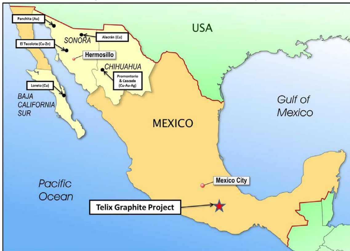
Figure 1: Location of Telix Graphite Project

“Azure is evaluating potential synergies for the development of Telix in conjunction with the proposed recommencement of operations at El Tejon.”